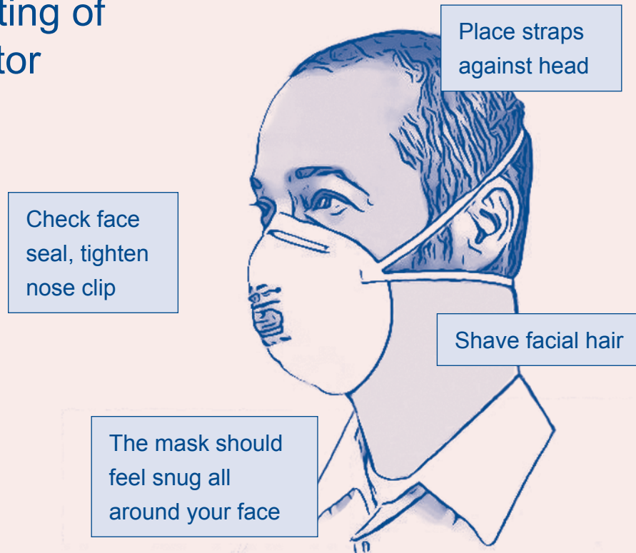
Image shows proper fitting of respirator. Image for demonstration purposes only, proper training is required, per Cal/OSHA Title 8, Section 5144.