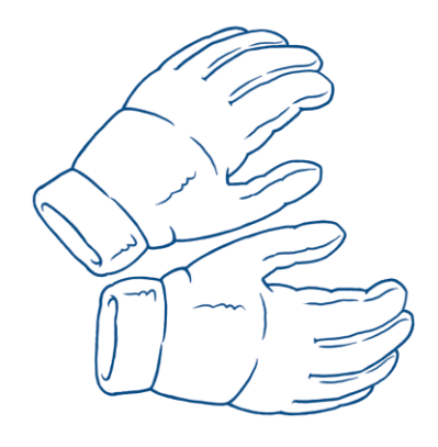
A. Use padded gloves to improve grip and comfort.