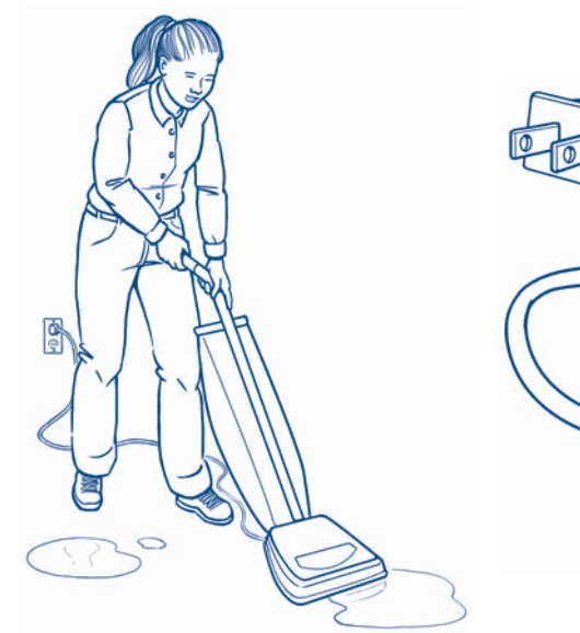
A. Vacuuming a wet floor.

Look at the pictures below. Which of these activities are safe? Which are unsafe? Why?