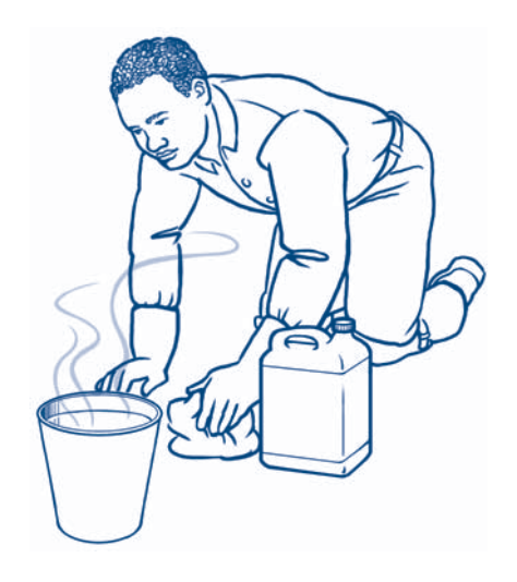
A. Using an unlabeled container.

Look at the pictures below. Which of these activities are safe? Which are unsafe? Why?