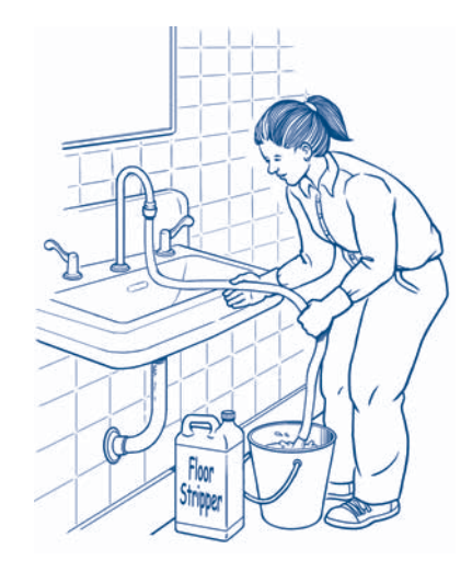
C. Diluting floor stripper with water.

Answers: A. Unsafe. All containers should be clearly labeled. B. Safe. Opening windows and doors improves ventilation. C. Safe. Full-strength chemicals are more toxic. Follow the manufacturer's directions.