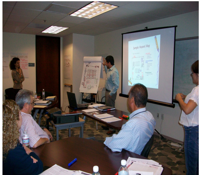
SASH Training, LA Unified School District, July 2010.

The SASH Program is the brainchild of the California Commission on Health and Safety and Workers' Compensation because of the high injury rate among California's school employees. The Program is implemented by the Labor Occupational Health Program at UC Berkeley with its training partner in Southern California — UCLA's Labor Occupa-